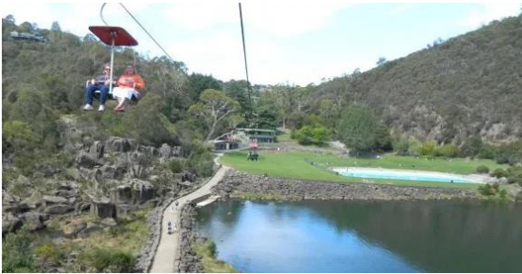
Cataract Gorge Reserve

Arrive Launceston, you will be escorted to your hotel to check-in and relax. Afterwards you will be driven to visit Cataract Gorge Reserve where you can enjoy a chairlift ride around 6:00 PM. Embark on your Penguin Tour in the evening.