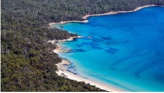
Freycinet National Park

Enjoy breakfast in the comfort of your hotel, rest of day is free for you to discover the area as you please, visit Freycinet National Park which is filled with natural assets including the granite peaks of the Hazards Range that dominate the Peninsula.