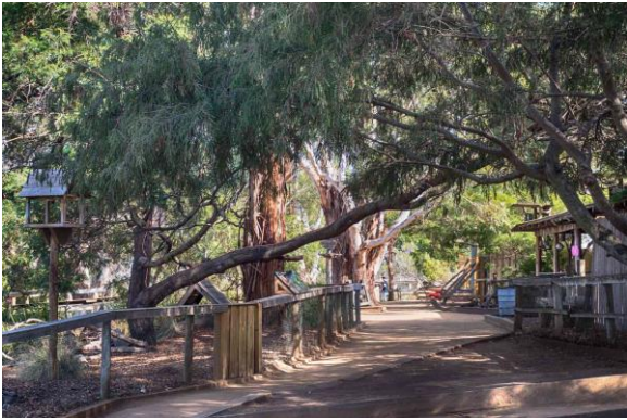
Bonorong Wildlife Sanctuary